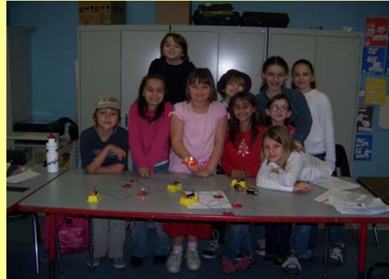
CORE/Butte's 3rd-5th grade science/math class created a circuit in their electricity unit that lit up a light bulb. Way to go class!